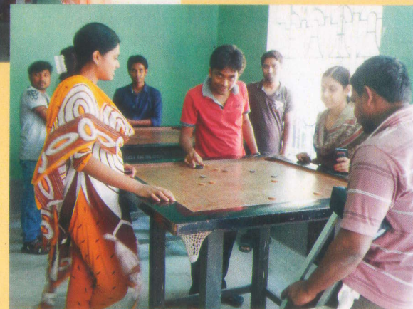
STUDENTS' UNION ROOM