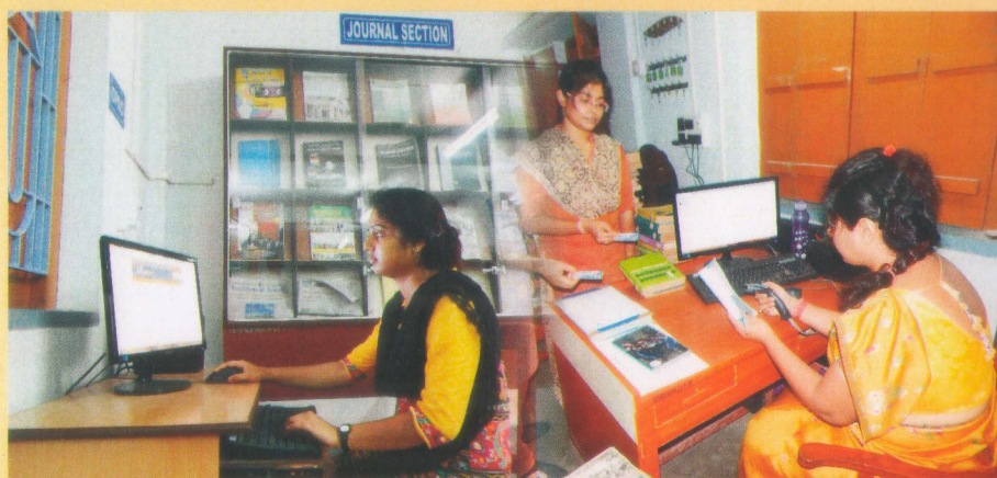
JOURNAL SECTION AND OPAC FACILITY