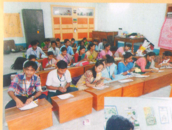
ART AND CRAFT RESOURCE CENTRE