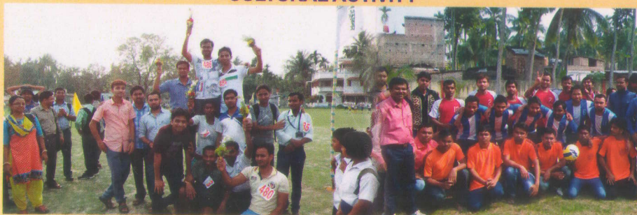
GAMES AND SPORTS