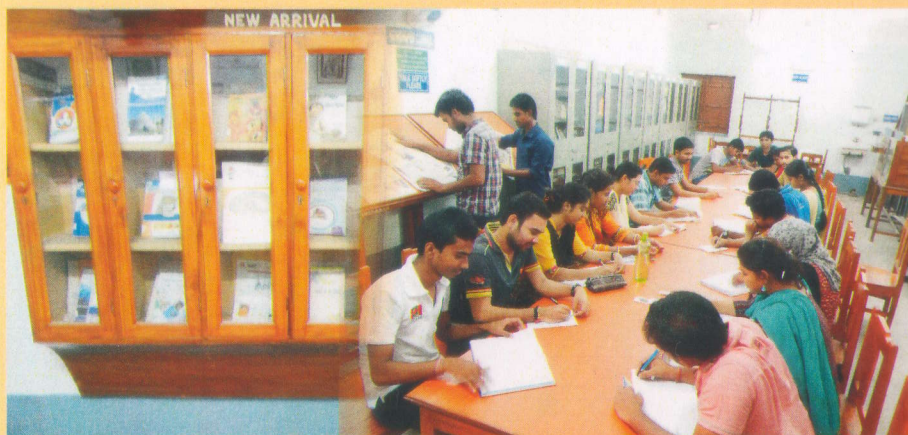
LIBRARY NEW ARRIVALS