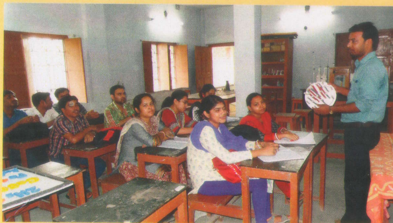
PHYSICAL SCIENCE LABORATORY