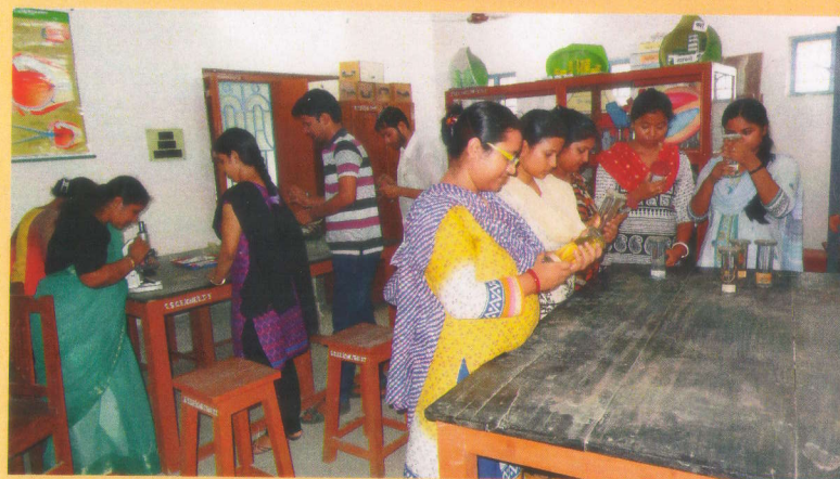
LIFE SCIENCE LABORATORY