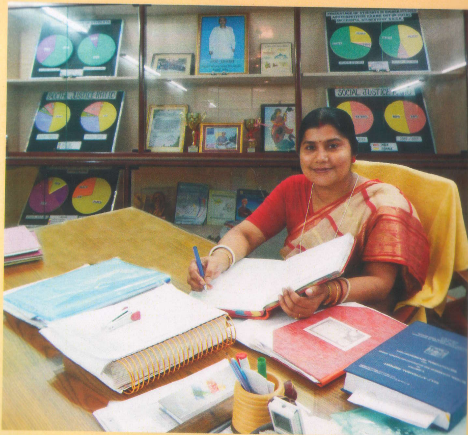
CHAMBER OF TEACHER IN-CHARGE